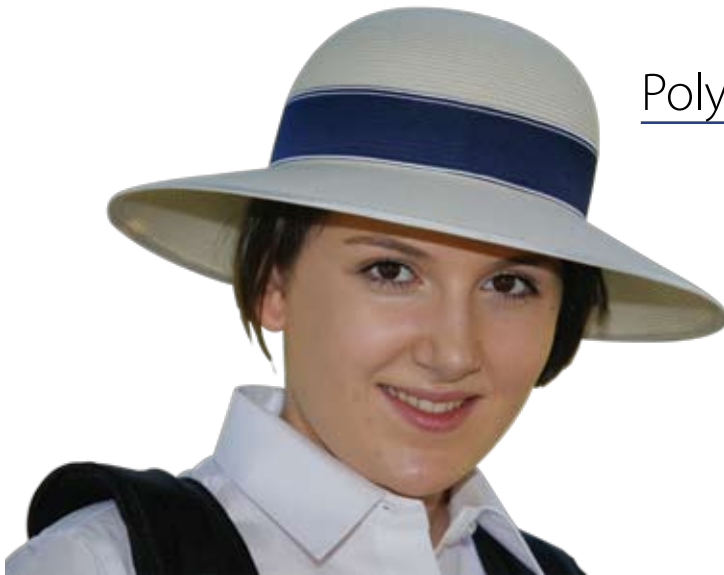
Poly Braid Hats